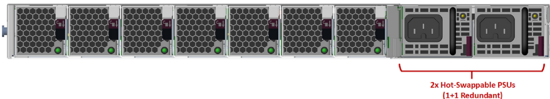
Figure 2. TippingPoint TPS TXE devices - back panel

Power supply 1 is on the left; Power supply 2 is on the right.