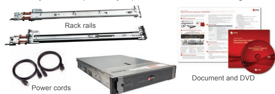
Deep Discovery Inspector appliance

Verify that the Deep Discovery Inspector carton contains the following items: