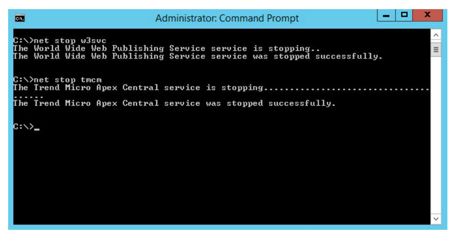
FIGURE 7-1. View of the command line with the necessary services stopped