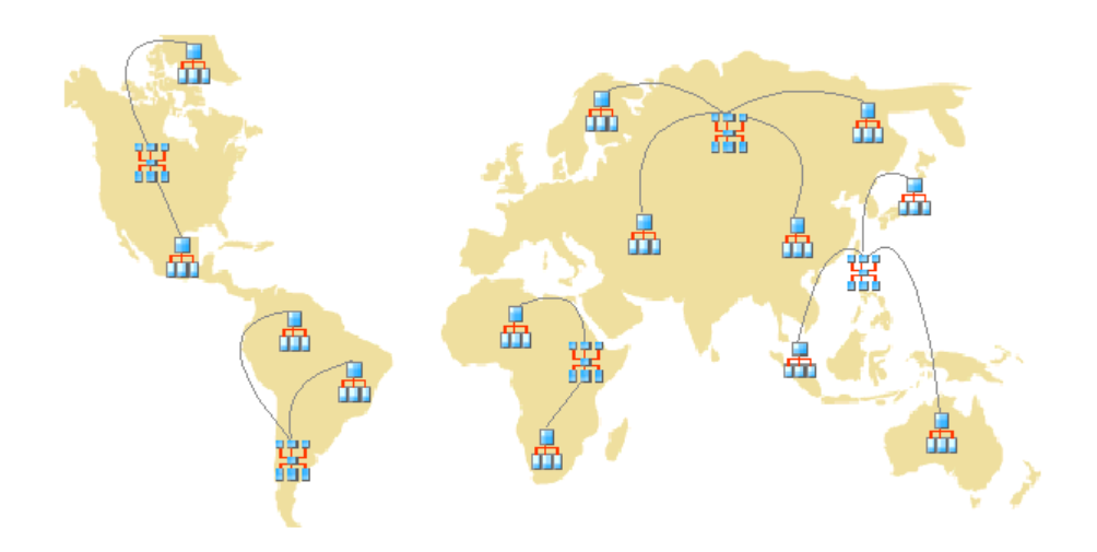
FIGURE 2-2. A multi-site deployment using multiple Apex Central servers

Deploy Apex Central servers in a number of different locations, including the demilitarized zone (DMZ) or the private network. Position the Apex Central server in the DMZ on the public network to administer managed products, endpoints, or other servers and access the Apex Central web console over the Internet.